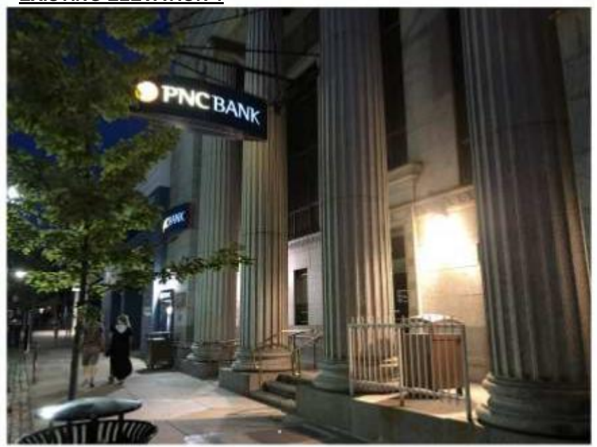
EXISTING ELEVATION 2