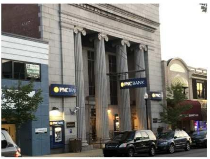
EXISTING ELEVATION 1