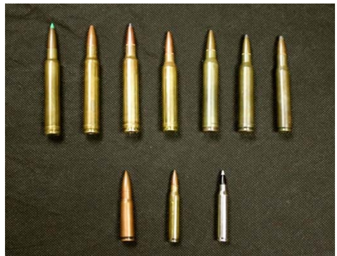
Figure 10. Big game hunting and military ammunition are high velocity and designed to retain bullet stability for delivering major destructive kinetic energy at longer distances. The top row is typical big game hunting ammunition, ranging on the left a 300 Weatherby magnum to the right a 30.06 Springfield. On the bottom row is typical military ammunition, on the left, an AK47; the middle, an M-4; and the right, an AR15 with a Teflon jacketed bullet.

The semiautomatic rifle, like the semiautomatic handgun, uses the recoil of the fired round to load the next round into the chamber. The semiautomatic rifle fires a round each time the trigger is fired until the magazine or clip is empty. Assault rifles are semiautomatic or fully automatic. An assault rifle is shoulder fired and uses intermediate-sized cartridges in a clip or magazine and may have selective fire between semiautomatic,