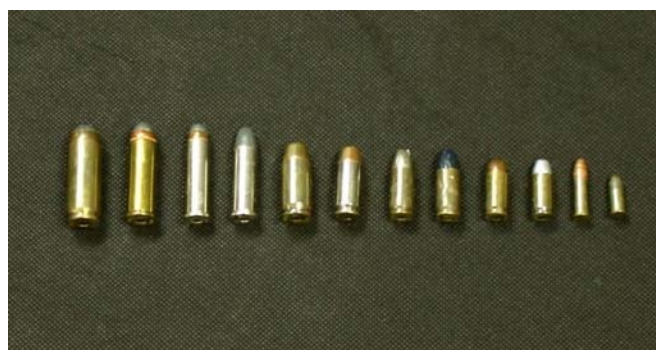
Figure 6. Handgun ammunition is considered low velocity and designed for short-range targets. The bullets vary widely in design; the left is a 50 cal magnum; the right, a 22 cal short.

The .380 is a round used in a semiautomatic handgun that is most well-known for its use by James Bond in the 007 movies. The .380 bullet is similar in diameter to the 9-mm semiautomatic handgun used by law enforcement and the military. Although the diameter may be similar among various bullets, the length and weight of the bullet and the amount of propellant are not normally distinguished in the nomenclature. Ultimately, this equates to the muzzle kinetic energy being different between the .380 and the 9-mm round (Fig. 5).