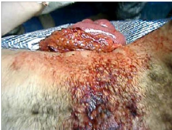
Figure 14. Evisceration of bowel through 3-cm exit wound on the left side of the abdomen created by high-velocity weapon (AK47), probably caused by cavitation effect.

Stopping power is the ability to wound enough to incapacitate the victim where they stand. This is in contrast to lethality, which is killing power. A lethal gunshot wound may