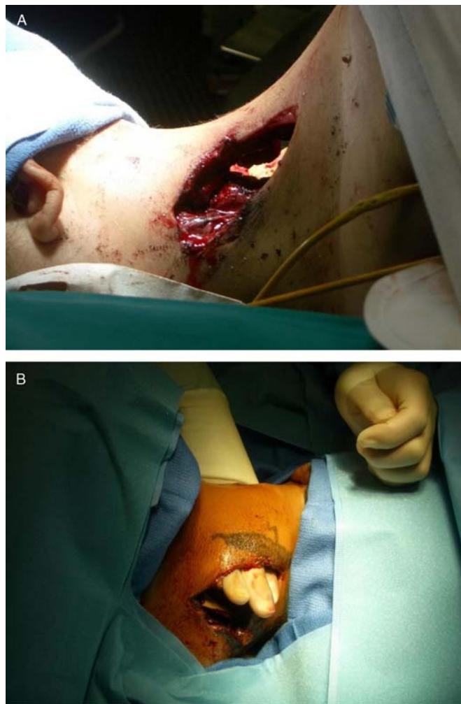
Figure 13. A, Gunshot wound to the posterior neck with large tissue defect. B, Wound with surgeon's hand in it.

A bullet with sufficient energy will have a cavitation effect in addition to the penetrating track injury. 35,36 As the bullet passes through the tissue, initially crushing then lacerating, the space left by the tissue forms a cavity, and this is called the permanent cavity . Higher-velocity bullets create a pressure wave that forces the tissues away, creating not only a permanent cavity the size of the caliber of the bullet but also a temporary cavity or secondary cavity, which is often many times larger than the bullet itself (Fig. 13). This temporary cavity depends not only on the energy imparted by the bullet to