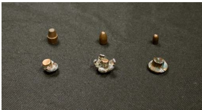
Figure 4. Fully jacketed bullets, on the top row, retain their shape when traversing tissue. Partially jacketed bullets are designed to expand upon entering tissue and thus deliver more of their potential energy to their target.

(density) of the bullet but the on composition of the bullet. The center of the modern bullet is typically made of soft lead because it is cheap, easy to work with, and readily available. The modern-day bullet comes in precise diameters, lengths, mass, shape, and outer jacket, all of these factors help determine the energy and tissue damage imparted to the target (Fig. 3).