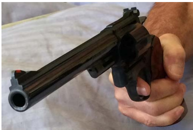
Figure 7. This is a 44 magnum revolver handgun, also known as “Dirty Harry,” and known for its relatively high muzzle velocity.

Revolvers have a revolving cylinder containing multiple chambers 5,6 that are capable of firing multiple rounds with a single load. Revolvers are of two types, namely, single action and double action. The single-action pistol requires the hammer to be manually pulled back against a spring with the thumb with the first action. The second action of the trigger being pulled sends the hammer forward striking the firing pin, which strikes the primer of the round in the chamber causing the bullet to fire. Every time the hammer of the revolver is cocked, the revolving cylinder realigns itself to the next chamber and is ready to fire the next round. The double-action revolver enables