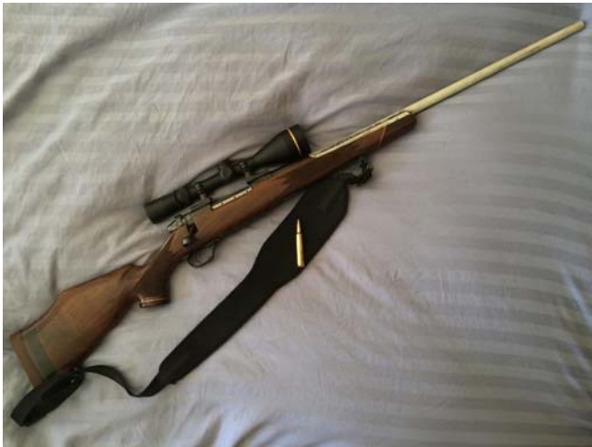
Figure 9. Bolt action rifle, 300 Weatherby magnum rifle, typically used for wapiti hunting.

shell, and loading the next round into the chamber and barrel. Modern-day semiautomatic pistols have a double-action capability. If a round has been chambered already and the hammer is in the uncocked position, a long pull of the trigger in one action will cock the hammer and send it forward with one long pull. After discharging the first round, the gun is then ready to be fired with a short pull as the discharging and recoiling process cocks the hammer and loads the next round simultaneously. Thus, with a semiautomatic handgun, all the rounds in the bullet can be fired as fast as the trigger can be pulled until the rounds in the magazine are spent. High-capacity magazines that can hold more than 10 rounds were federally banned from manufacture in the United States in 1994, but this ban was allowed to expire and has not been legislatively renewed at the federal level. Eight states currently have bans on these magazines. Consequently, most pistols sold in the United States can hold 7 to 17 rounds, but high-capacity magazines holding up to 30 rounds are easily available.