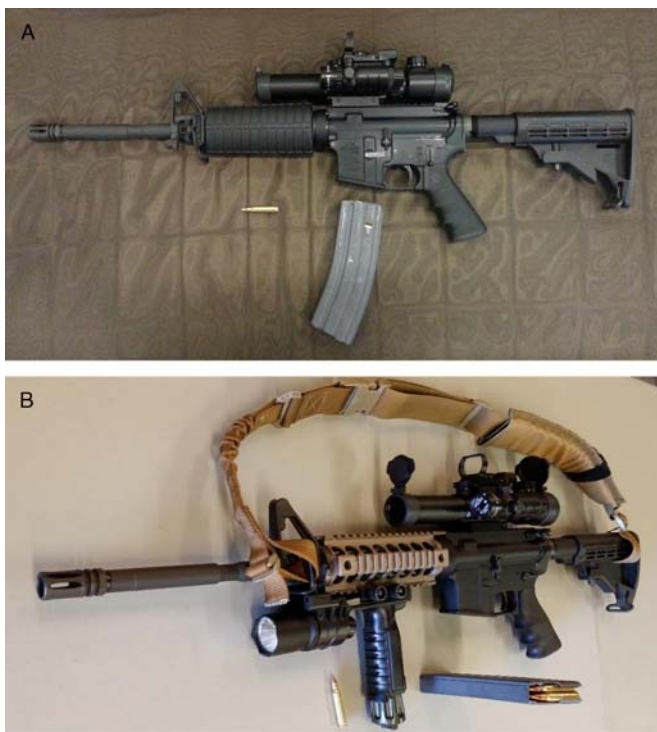
Figure 11. A, Semiautomatic assault rifle with adjustable stock, scope, heads up sighting system, and laser targeting device. B, Same rifle with a different handguard, lighting system, and sling.

Shotguns are a smooth bore long arms that fire a variety of projectiles from small spherical pellets (birdshot) to large spherical pellets (buckshot) to solid lead projectiles (slugs). Shotguns have an external appearance similar to rifles but differ in the lack of rifling inside the barrel. They exist in breach load, pump (rounds are ejected and the weapon rearmed from a magazine with a pump of the forearm mechanism), lever action (works much like a pump shotgun but uses a lever to extract and chamber shells), and semiautomatic varieties. These have a wide caliber range, from 5.5 mm to approximately 2 cm (Fig. 12). Gauge is the caliber of the shotgun. It is determined by the number of lead balls of equal size that make one pound. A 12-gauge shotgun is the most popular hunting weapon that has a bore diameter equal to the size of 12-lead balls that add up to one pound. As the gauge of the shotgun increases, the caliber