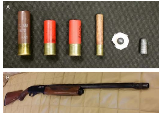
Figure 12. A, Shotgun ammunition usually contains multiple pellets, varying considerably in number and size, which are designed for short-range targets. On the right are 50 cal lead slugs used in muzzle loading rifles. B, Sears-Roebuck semiautomatic shotgun.

of the barrel decreases (Table 6). The most commonly used shotgun shell is the “birdshot” consisting of hundreds of small lead pellets. “OO” double ought buckshot contains only nine pellets, and each has the potential wounding equivalent of a small handgun round, and a “slug” is one large projectile.