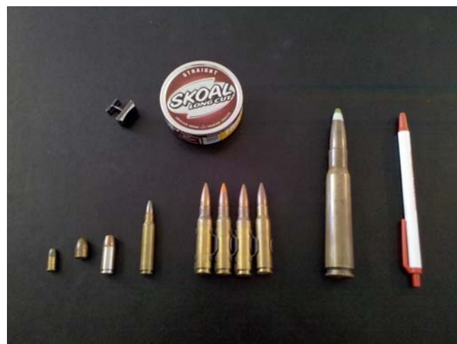
Figure 3. Various sizes of bullets and rounds. Variety of cartridges or rounds, from 0.22 cal handgun round, 9-mm hollow point handgun round, 5.56-mm rifle round, 7.63 rifle rounds, 0.50 cal rifle round, average pen for comparison.

The projectile or bullet is the part of the cartridge that exits the weapon and comes in every imaginable shape and size. Bullets are an important part of the damaging potential of a weapon because they affect the kinetic energy imparted to the target tissue. It depends not only on the size and weight