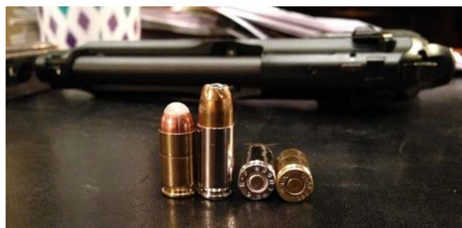
Figure 5. .380 caliber round next to 9-mm hollow point round next to 9-mm round next to .380 round. When compared side to side, the rounds are different, but when comparing them from the back, the diameter of the rounds is similar.

Another important variable of shape is the hollow point bullets designed for handguns (Fig. 5). Handguns are for short range, and thus, the flight characteristics are less important. One of the design intents of hollow point bullets is that the hollow point will result in more deformation of the bullet on impact, and thus, more tissue injury will occur, but the main design characteristic is that the deformed bullet is less likely to pass through the body, minimizing the potential of bystander injury. 26 If the bullet deforms and does not pass through the victim, then the entire kinetic energy of the bullet is imparted