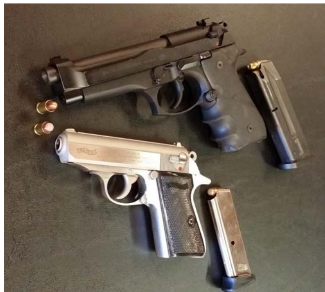
Figure 8. Semiautomatic pistols. Top gun is Baretta 92FS Brigadier, similar to the weapon used in the military. Bottom gun is Walther PPK, which is small and concealable, popularized in Ian Fleming’s novels featuring James Bond 007.

the shooter to pull the trigger (long pull), which cocks the hammer and fires the gun, performing a double action with just one pull of the trigger. A double-action revolver can also function as a single-action revolver when the hammer is cocked back against the spring and the pull of the trigger (short pull) sends the hammer forward striking the pin.